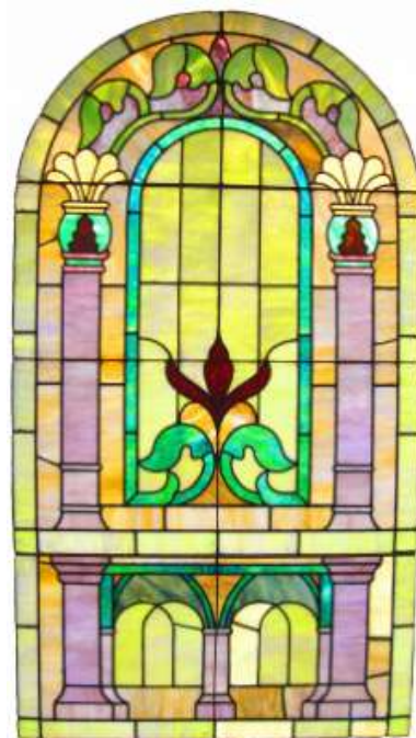
Salem Stained Glass Centennial 1912 - 2012