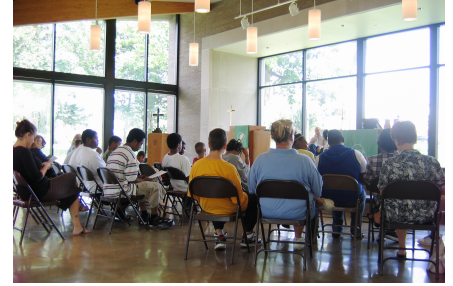
Midweek worship in Lutherwood chapel

These weekly services are led by Indianapolis community volunteer pastors. We invite you to join us during your lunch hour for worship Wednesdays at 11:30am in Lutherwood chapel.