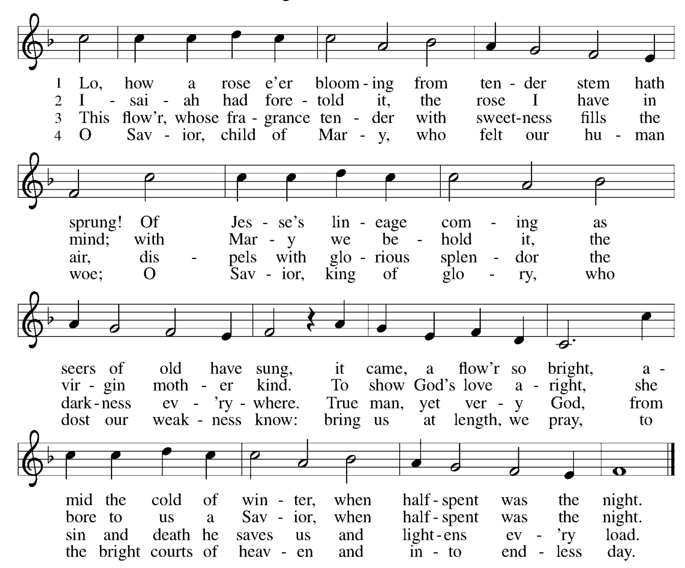
Carol: Lo, How a Rose E'er Blooming